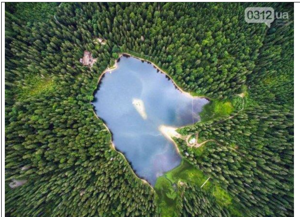
Lake Synevyr from the height of the bird's eye.

http://mizgir.com.ua/news/obschestvo-1/4777-ozero-sinevir-z-visoti-ptashinogo-polotufoto.html